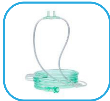
Nasal Oxygen Cannula